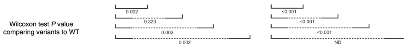
Figure 2. Rosetta redesigned mutants exhibit increased breadth and potency against HIV. Binding and neutralization profiles for the characterized PG9 mutants. Antibody mutants are shown using Kabat numbering. The virus name is shown in the left column, and amino acid sequence for position 160 (HIV strain HXBc2 numbering) is shown in the second column. Strains lacking a potential N-linked glycosylation site are indicated with bold rows. A yellow-to-green color scale indicates ranges of values, from less than 0.01 µg/ml to greater than 100 µg/ml, respectively, for concentrations needed for half maximum signal in ELISA (EC 50 ) in the left panel. A yellow-to-green scale from 0.4 ng/ml to greater than 33 µg/ml, respectively, is shown for half-maximal concentration needed to inhibit virus infection (IC 50 ), in the right panel. Each ELISA experiment was done in triplicate, and neutralization was done in duplicate. A Wilcoxon test was used to determine if the distributions for binding and neutralization were statistically significant from WT PG9. The P value for comparison of each variant against WT PG9 (comparing the pattern of results in a single variant antibody column against the results in the left column for WT PG9) is shown at the bottom of the panels and reflects a 2-sided significance at a level of 0.05.

*Potential N-linked glycosylation site at position N160 (HXBc2 numbering)